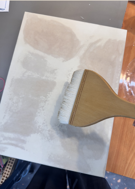
Hake brush on hanji