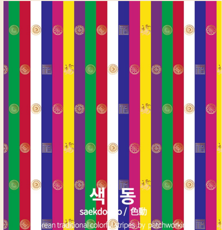
Saekdong — traditional palette