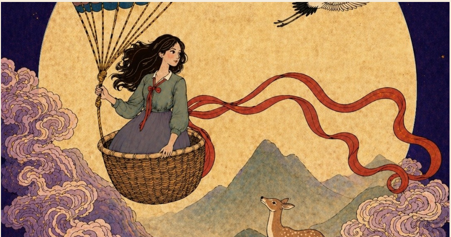
Detail — Sky Crossing

“A home of one’s choosing” names this quiet act: deciding, on one’s own terms, where belonging begins.