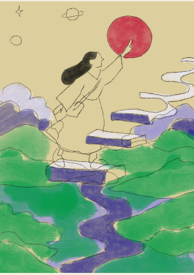
Sketch — ascending

Each painting starts as a small private desire — a woman fishing, a woman climbing, a woman lying still. It is sketched, refined in line, then painted in pigment and nikawa on hanji-wrapped panel.