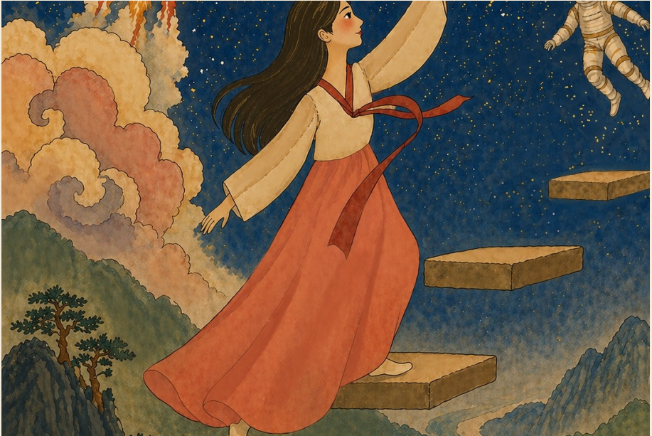
Detail — A Home of One's Choosing

This project reinterprets Korean minhwa and ink-wash visual language to imagine women's freedom, movement, and self-chosen belonging. Doors open. Paths begin. The sun and the moon mark time. A woman stands inside a much larger world, and chooses where to go.